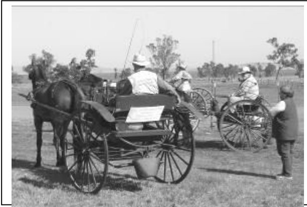
Waiting to start at Windy Station on the Charity Drive

to the organizers from Goulburn club members. Our members are looking forward to next year's drive.