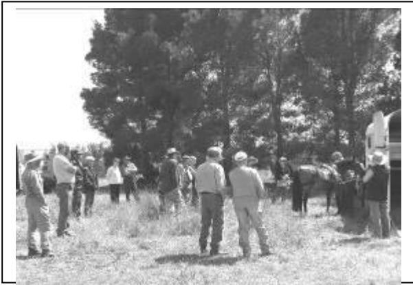
The 'Introduction to Carriage Driving Day' at Wirrimah