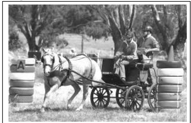
Suzie Ffrost negotiating one of the MOs at the CDE Championships at Marrar

Having only five MOs which have served us for years, we set about constructing an additional two MOs, thus giving us the minimum number allowed for a Championship event. Material was scrounged and secured for the erection of two new MOs and over the course of a weekend, a few willing workers were able to dig some 42 holes, and put up and paint the additional MOs.