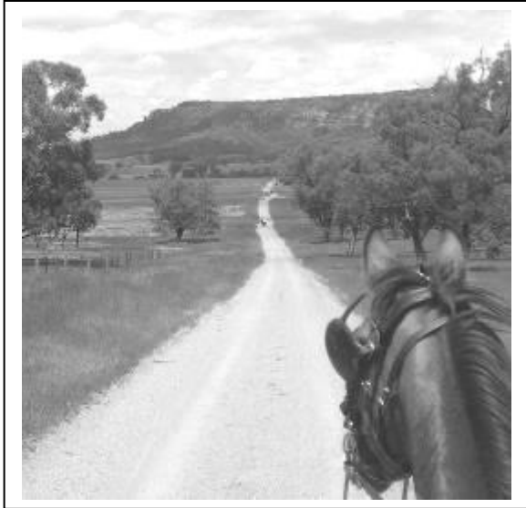
A road stretching into the distance at Thornthwaite

whether a drive would happen. Being always good troopers, everyone geared up in preparation. Surprisingly, then the sun broke out and everyone set out on a great drive of 24km about 3.30pm, returning via the Homestead Block about 5.30pm. The hot showers afterwards were very welcome, and a big night was had around the campfire. Sunday's drive was over a distance of 44km so lunches were packed before heading out at 10am.