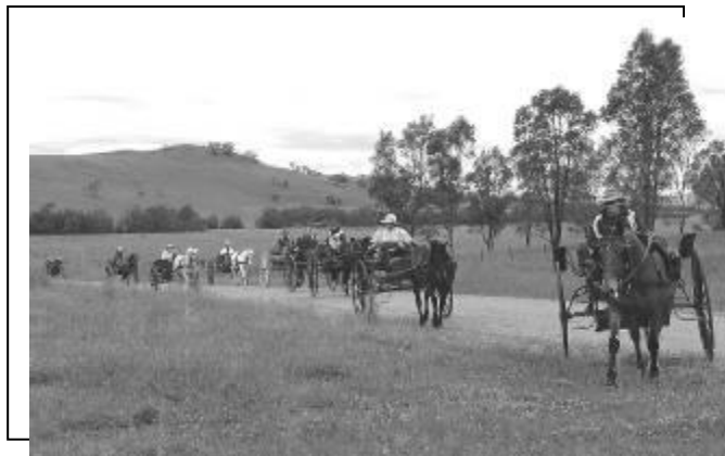
Traversing more of the beautiful countryside on the Thornthwaite drive