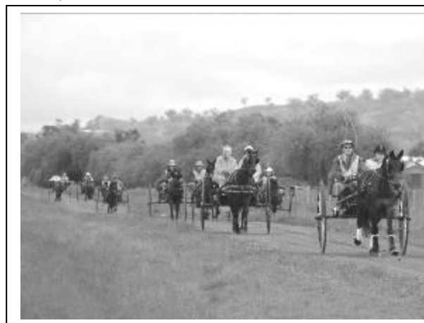
On a quiet lane near Attunga on the Liverpool Range Club Charity Drive

preferred format, and it allows all, including the organizers, to have a pleasant, more relaxing holiday with their horses.