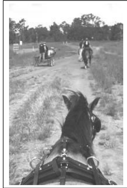
On the Murrumbidgee Club pleasure drive (N Barry)

Robyn Schmetzer: The Murrumbidgee Club held a pleasure drive on October 23 to experience the course we have mapped out for our CDE in September 2017. All agreed it was a lovely drive off busy roads.