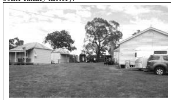
The shearers' huts at Thornthwaite With the skies meant to clear in the early afternoon, lots of discussions were had regarding