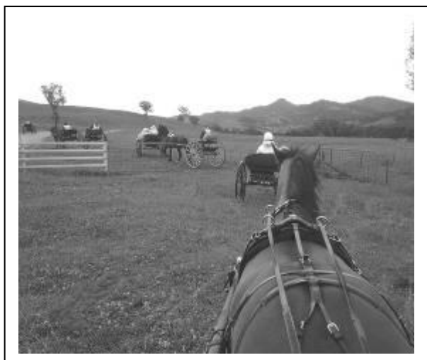
Going through a gateway on the Thornthwaite drive