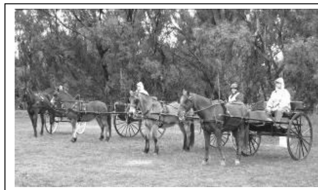
Liverpool Range members on the Henry Lawson Drive

Ten enthusiastic members started off June by participating in the Grenfell to Gulgong Henry Lawson Pilgrimage Drive. This was the most incredible fortnight, spent driving through the NSW central west and visiting many little towns on the way. The scenery was magnificent, the food fantastic and the socializing both entertaining and enjoyable. A great big thank you is extended to the Gulgong Heritage Harness Club for the wonderful organization and large amounts of time and effort that went into this truly memorable drive.