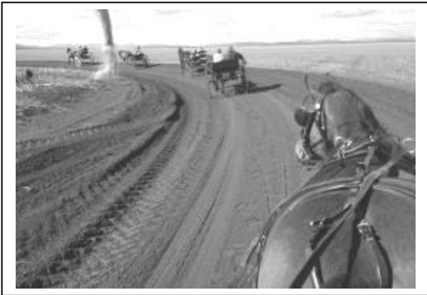
On the black soil plains on the Spring Ridge Drive (P Honeyman)